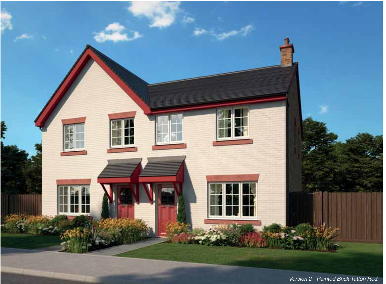
Version 2 - Painted Brick Tatton Red.