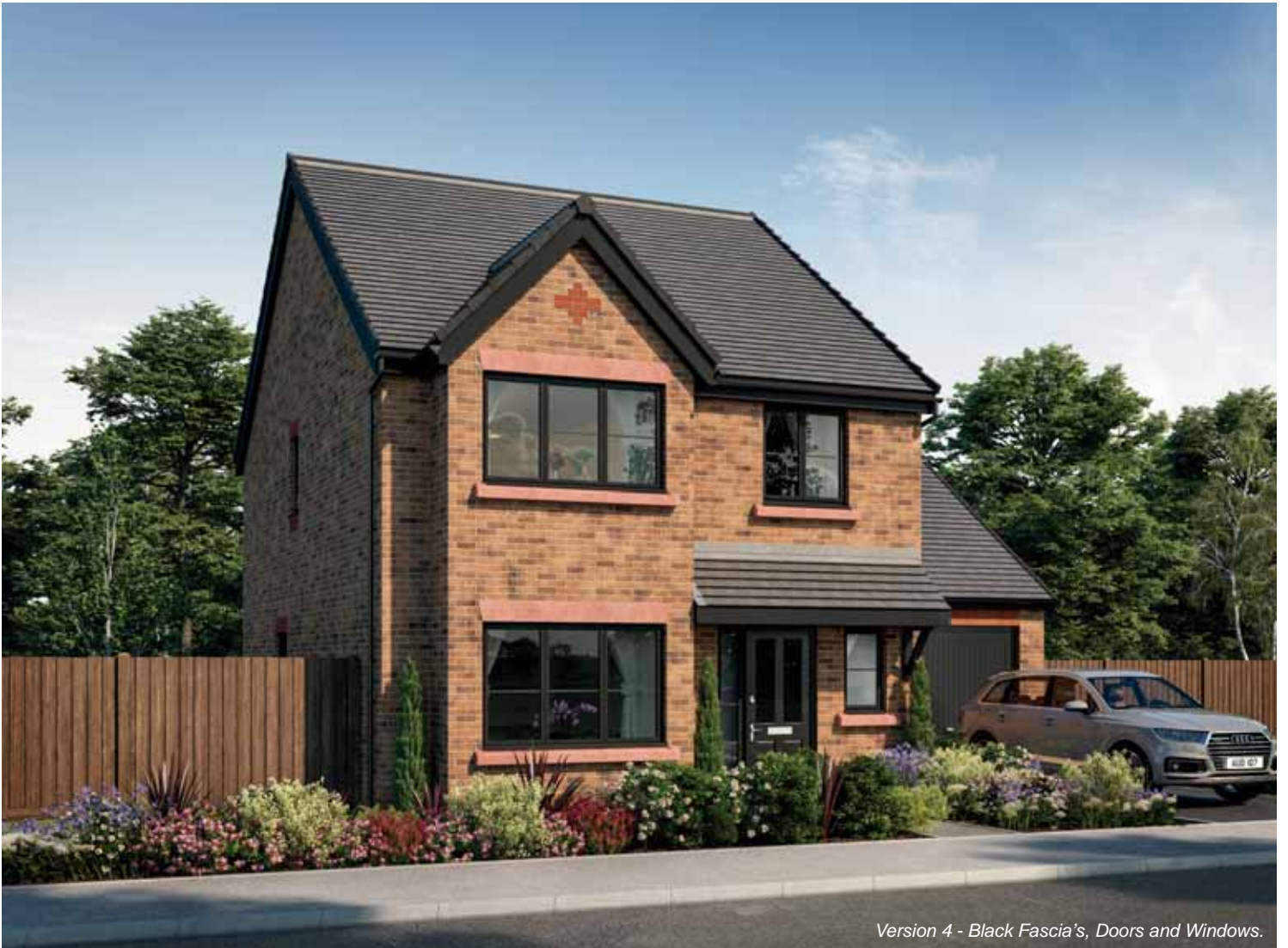
Version 4 - Black Fascia's, Doors and Windows.