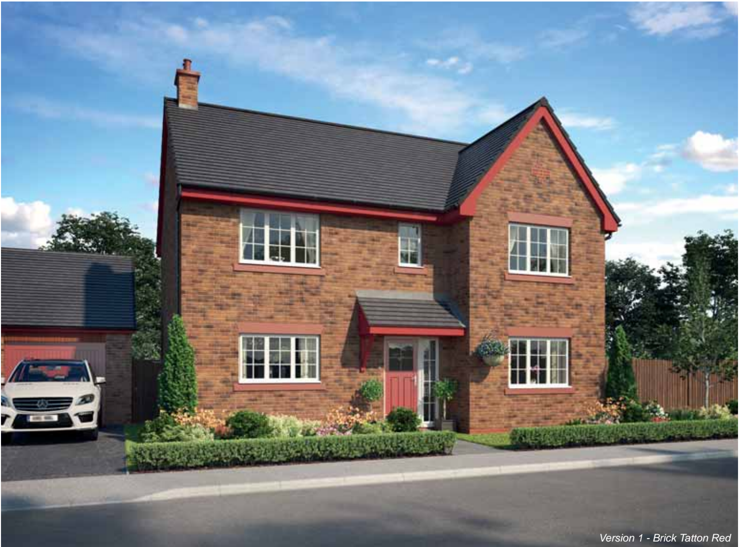
Version 1 - Brick Tatton Red