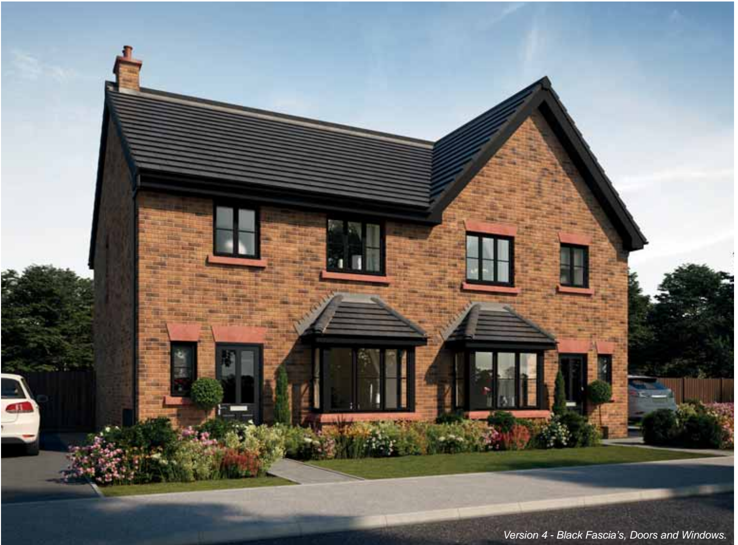
Version 4 - Black Fascia's, Doors and Windows.