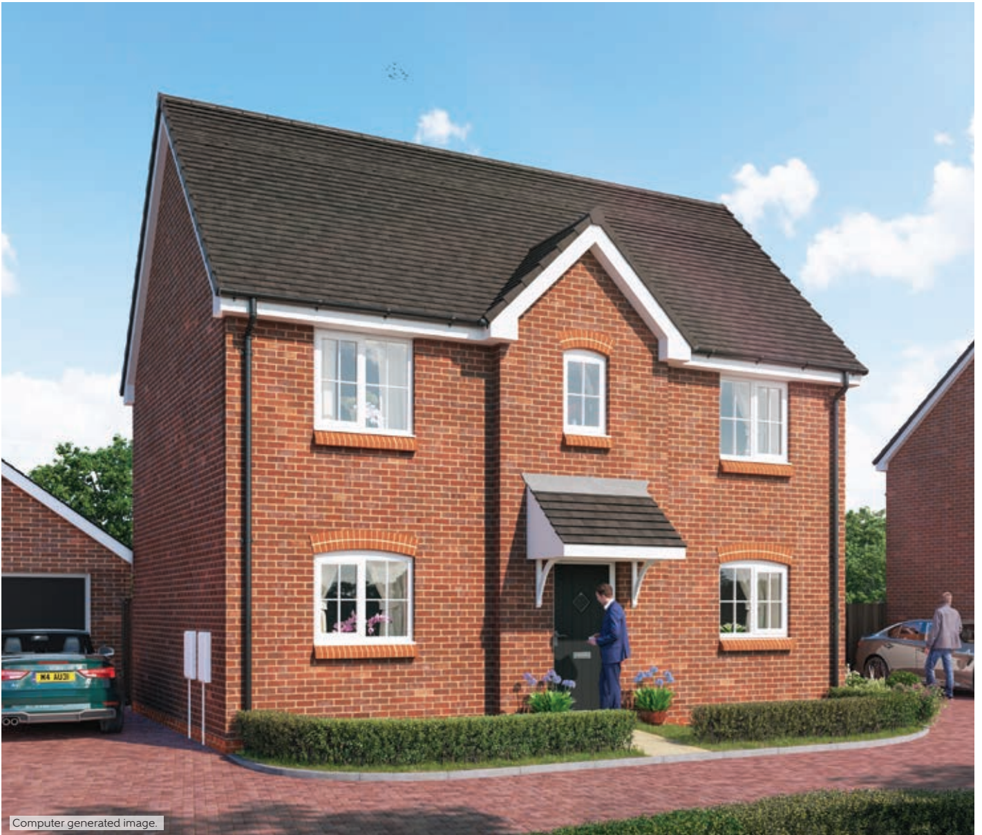
Computer generated image.