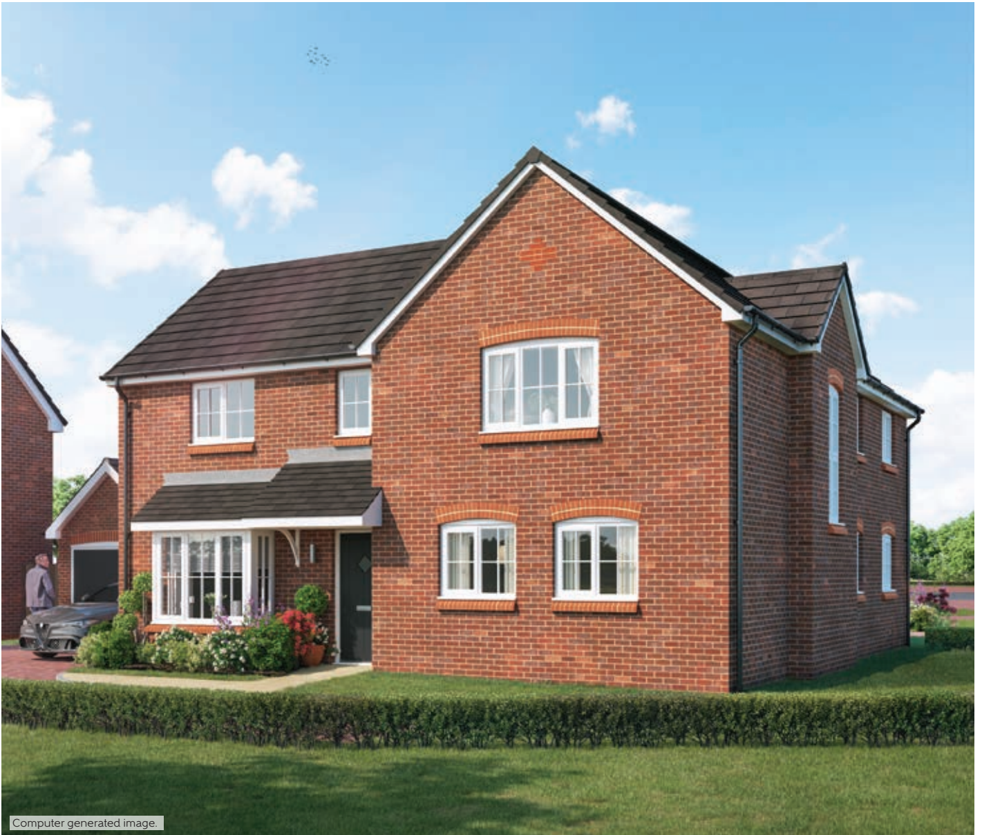
Computer generated image.