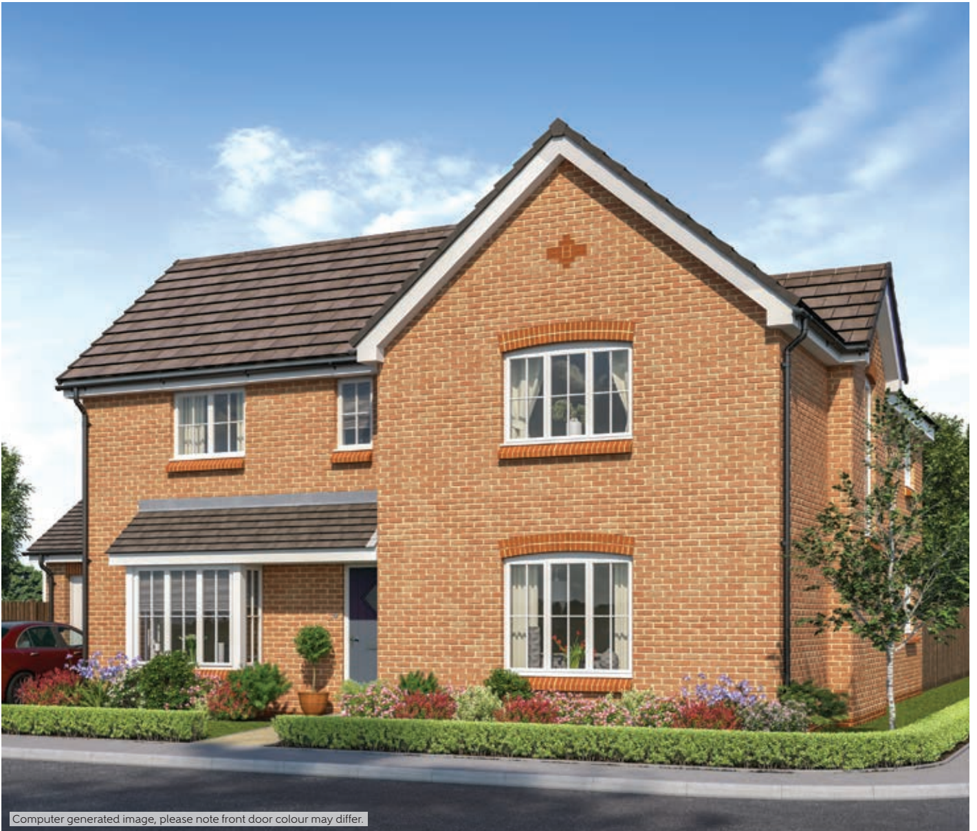
Computer generated image, please note front door colour may differ.