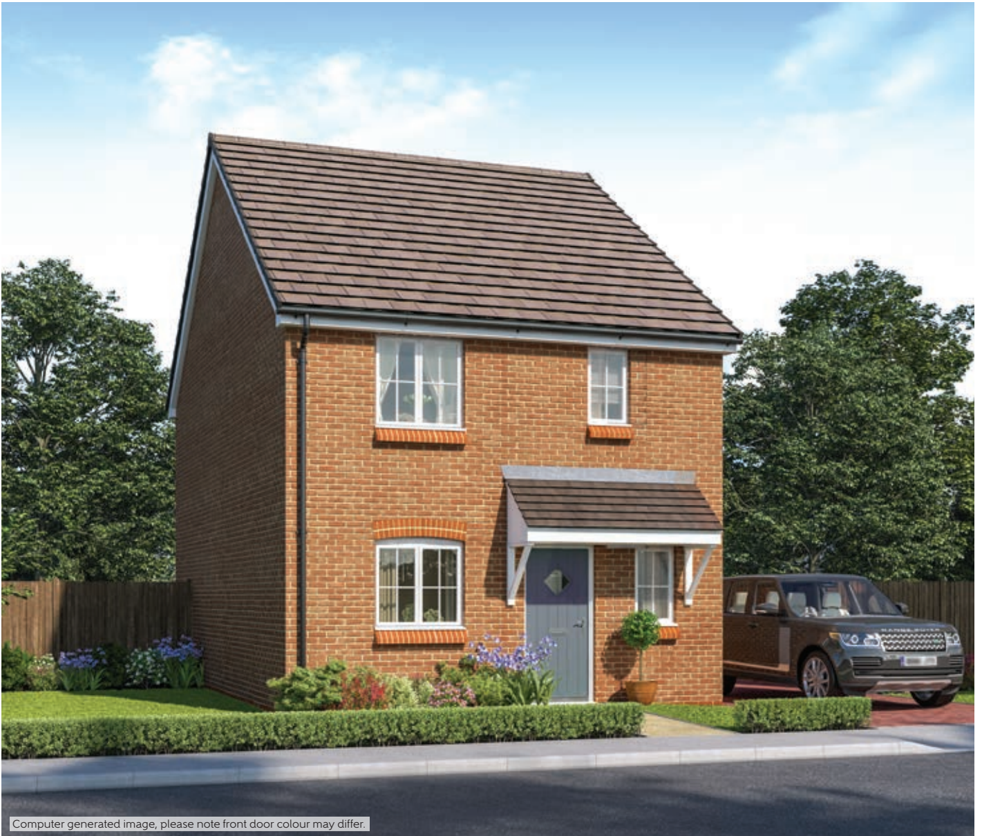
Computer generated image, please note front door colour may differ.