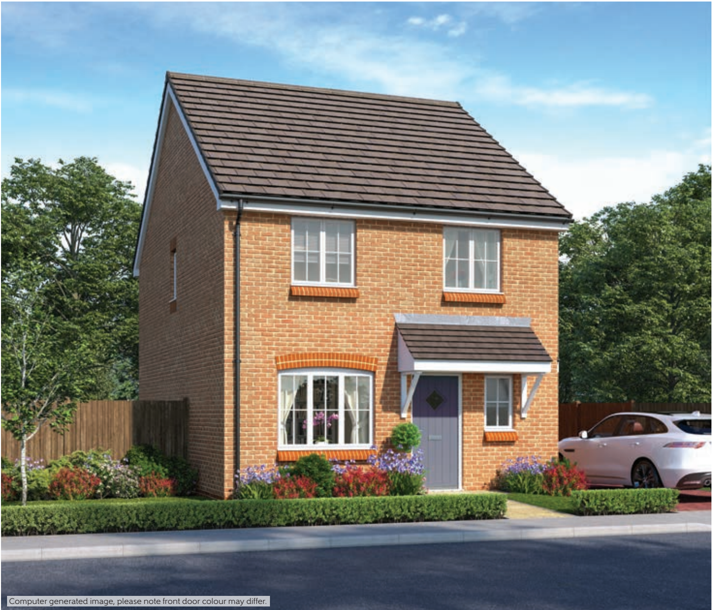
Computer generated image, please note front door colour may differ.